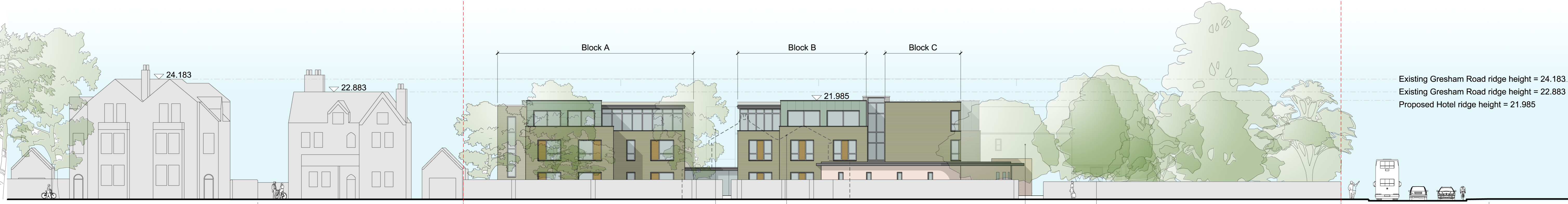
Proposed Gresham Road Elevation

Existing Gresham Road ridge height = 24.183 Existing Gresham Road ridge height = 22.883 Proposed Hotel ridge height = 21.985