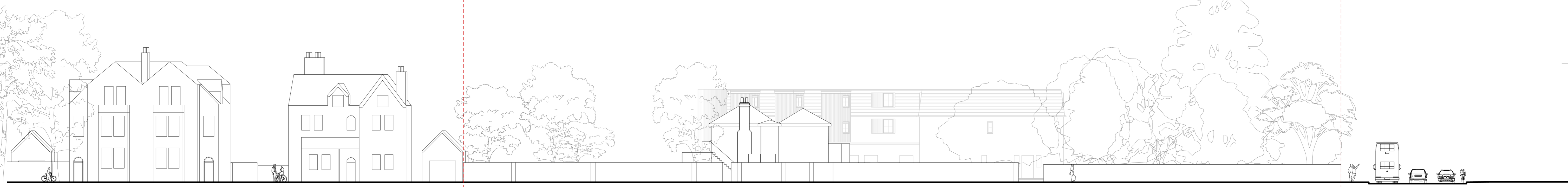
Existing Gresham Road Elevation